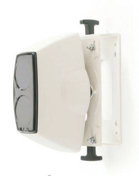
Fireray® 50/100RU mounted on bracket