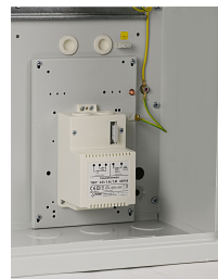
Transformers series: TRP...