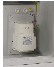
Transformers series: TRZ...