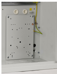
Empty mounting plate

Can be used for mounting transformers or power supply units: