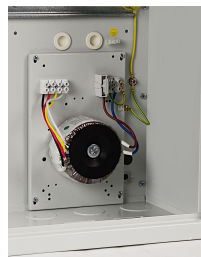
Transformers series: TOR...