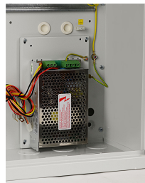
Enclosed PSU series: PS..., PSB...