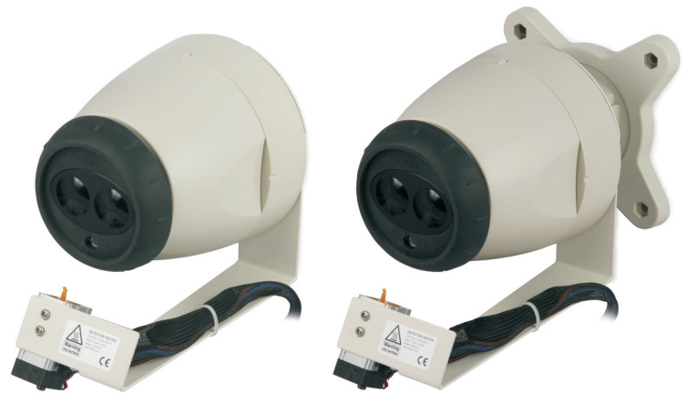
Anti-Condensation Heater with Detector Head