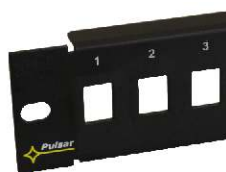
Patch panel RAP-SCAPC1